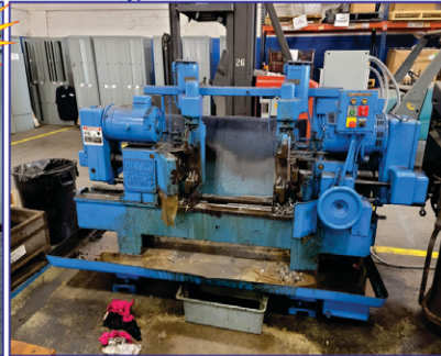
Hey No. 3 Automatic Facing & Centering Machine