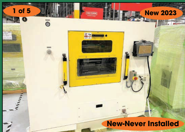
CHORNG MACHINERY (Taiwan) TOOL PARTS GRINDING MACHINE