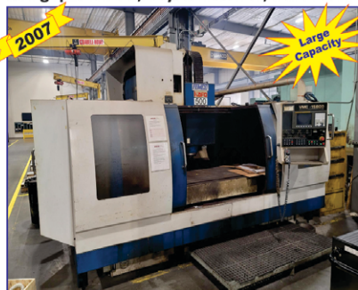
Femco VMC15800 CNC VMC

Featured Machines and Equipment: 2007 Femco VMC15800 CNC VMC, Fadal VMC4020 CNC VMC, Fadal VMC6030 CNC VMC, Haas TL-25B CNC Lathe (with Programmable Sub Spindle), Okuma MC-4VAE CNC Vertical Mill, Cincinnati Milacron 10VC-1000 CNC Vertical Mill, 6" G&L Floor Type HBM, Shibaura BT-10B Table Type HBM, VWF Table Type HBM, Hyd-Mech M-20A Horizontal Bandsaw, Marvel Series 8 MK 1 Vertical Bandsaw, Rockwell Model 20 Vertical Bandsaw, Mori Seiki, Monarch and LeBlond Engine Lathes, Schiess VBM, Bridgeport Mills, Toyota Forklift, Radial Arm Drills, Tooling, QA/QC, Sterling Semi w/ Trailer, Ford 335 Front End Loader, and More!