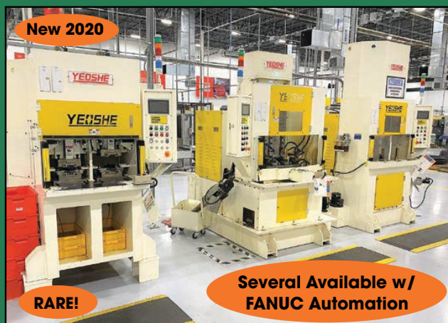
VIEW of YEOSHE BROACHING & STAMPING MACHINES