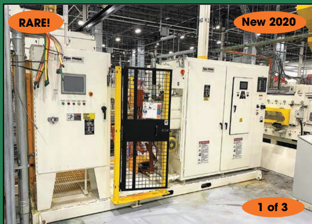
AJAX-TOCCO #PACER-T INDUCTION HEATER

SALE DATE: Wednesday, September 13th, 11:00 AM (ET)