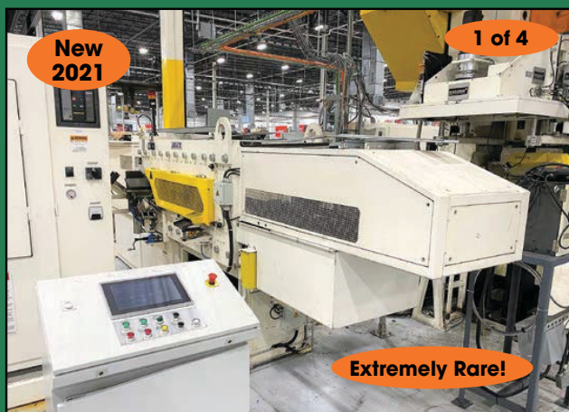
AMT #WRL-4013-01 CROSS-WEDGE ROLL FORMING MACHINE